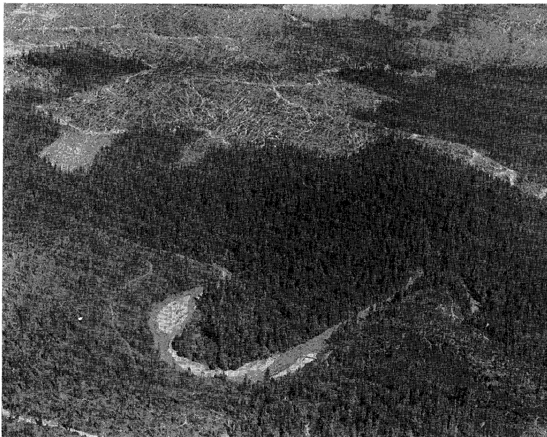
Redwood Creek in 1975. The Tall Trees Grove is located on the "peninsula" jutting out in the foreground. The land in the foreground had been logged over prior to park establishment. The area in the background had been clearcut since park establishment.

cut ground and were subjected to the sounds of nearby logging operations. 156