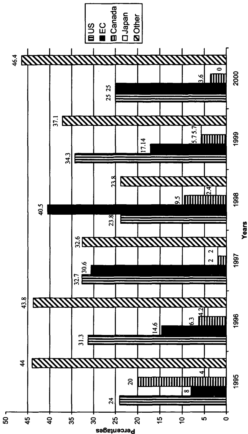
FIGURE 2.—Complainant states