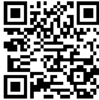
Figure 1: QR-Code Linking to This Article on BTLJ.org

Thus, the Mixed Reality revolution is already happening. The real world is already alive and crawling with attached data. Data is routinely attached to real-world people, places, and things, and mobile devices permit users to experience this local data in the place to which it is attached. Well in advance of the advent of the pervasive computing world, data tagging has already hyperlinked and virtualized the real world—our world today.