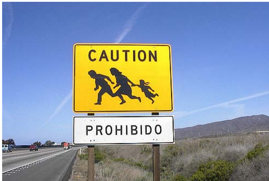
Fig. 2. Sean Biehle, Prohibido , licensed under CC BY 2.0.

Prohibitory signs—such as a sign stating “No Smoking”—are, according to Hermer and Hunt, never simply “iconic injunctions.” 20 Rather, they are “part of a much larger series of articulations that seek to direct the behavior of people in a wide variety of social situations and spaces.” 21 Thus, the sign is not just about behavior at the site of the sign. Moreover, the behavior being shaped by the sign is not only controlled by the sign. And here we should note that some of the Caltrans signs were labeled with words both in English and Spanish, including one placed on the shoulder of the northbound I-5 by the San Clemente border stop. 22