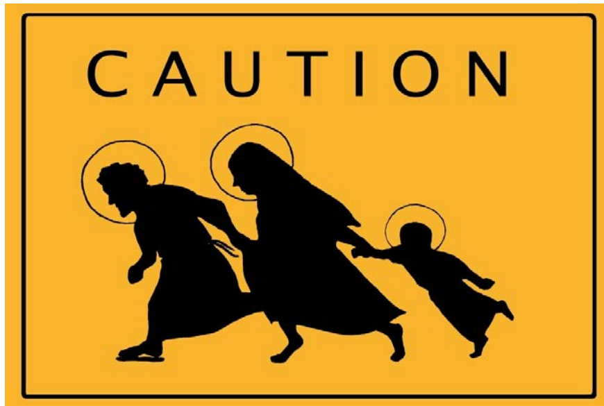
Fig. 5. Jerise, No Room at the Inn, https://www.etsy.com/shop/jerise , by permission.

One sign retains the yellow background, the heading CAUTION and the three figures of man, woman and child running towards the left, but adds robes and halos to each of the figures and removes the flying pigtails from the child, suggesting the child is gendered male. 42 The mother and child are barefoot; the father wears on his visible foot a sandal. This is a rendering of Joseph, Mary and the baby Jesus, seeking sanctuary. Here, the viewer of the sign is told that anonymous “illegal immigrants” in flight may in fact be the Holy Family seeking refuge.