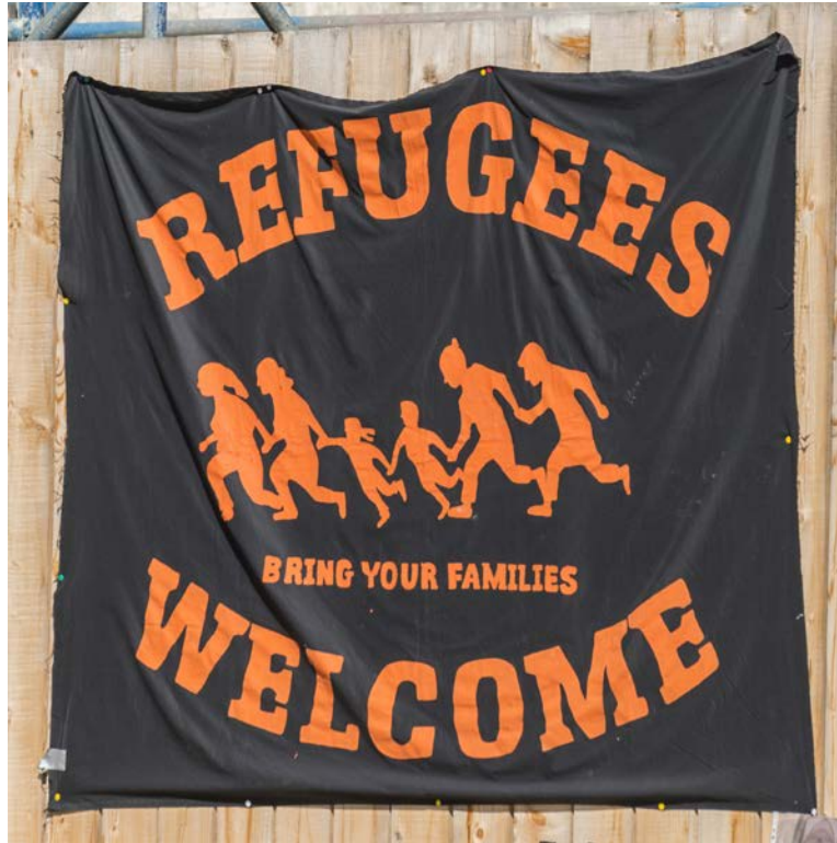
Fig. 10. Refugees Welcome, Regensburg, Germany, in front of the Dom

The conjoining of the image with “REFUGEES WELCOME” and, in smaller font, “BRING YOUR FAMILIES” also frequently appeared, sometimes with two female and two male figures together flanking two children, perhaps to circumvent the implicit heteronormativity of the initial Caltrans sign. 70 In this version of the image, the leading figures are female, pulling a female and male child, followed by the two men, in the reverse gender order of the Caltrans sign with the father leading the family unit. We could note here the vision of the nuclear, heterosexual family as the ideal unit of refugee welcome, against the concern that most of those entering Europe were single young men; here we have a gender-balanced large family grouping being welcomed. 71 Or perhaps the additional female and male figures are German supporters assisting those who are fleeing; the new female figure wears pants and has hair whose stiffness suggests pulled-back dreads; the new male figure sports a hipster “man bun.”