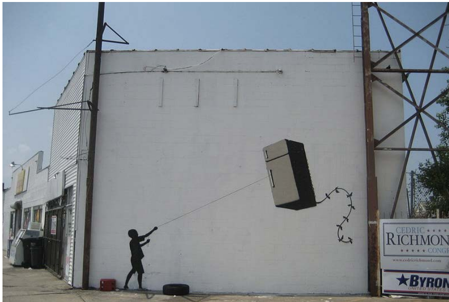
Fig. 15.

That this image was called Kite-2 raises the question as to what is Kite-1. Kite-1, painted on a wall in New Orleans after Hurricane Katrina, depicts the silhouette of an African American boy, who stands and flies a kite which is actually a refrigerator, magically aloft. 125