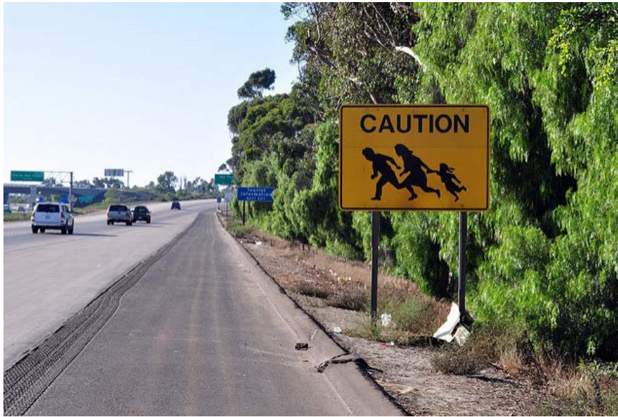
Fig. 1. Jonathan MacIntosh, Caution Economic Refugees , licensed under CC BY 2.0.

The sign's original purpose was to alert drivers to pedestrians crossing the freeway. Between 1987 and 1991, at least 227 people were struck by cars and trucks when trying to cross the freeway in order to avoid capture by immigration agents; 127 were killed and many were injured. 3 Particularly dangerous were two areas: one by the San Ysidro checkpoint just north of the border, where eighty-seven people had been killed by cars as they tried to run into the United States from Mexico, and the second, an area by Camp Pendleton, south of an interior border checkpoint at San Clemente, where another forty had been killed. Agents at the San Clemente checkpoint seized 75,000 undocumented immigrants in 1990, mostly from the floors or trunks of vehicles. 4