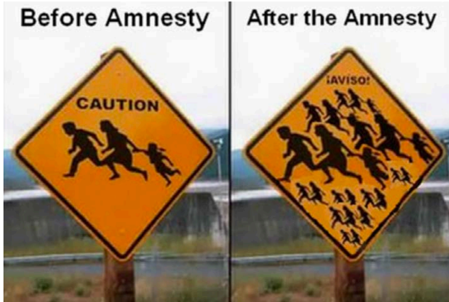
Fig. 3. Image downloaded from http://the-american-catholic.com/2014/01/31/all-you-need-to-know-about-the-leaders-of-the-house-gops-embrace-of-amnesty/ in January 2017.

The reformulated image appears intended to warn of the dangers of “amnesty,” such as was created through the Immigration Reform and Control Act in 1986, which legalized approximately 2.6 million undocumented immigrants.