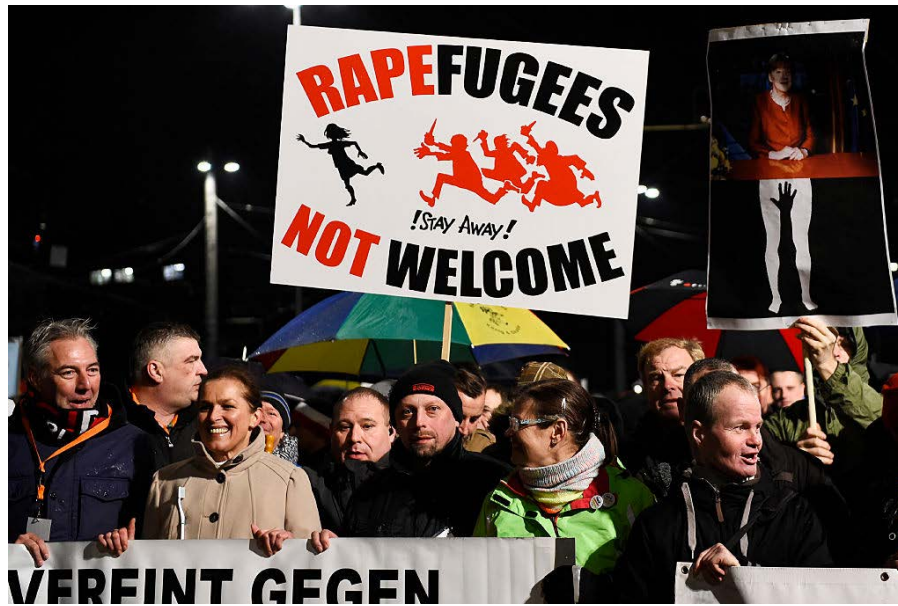
Fig. 12. Protestors from the PEGIDA Movement March During a Rally in Leipzig, Jan. 11, 2016

There are obviously many ways in which the events in Cologne track already existing concerns about gender and Islam that have long been part of a vision of rapacious Muslim men, and suffering and submissive Muslim women. 85 Here, the victim is not a Muslim woman but a non-Muslim German woman.