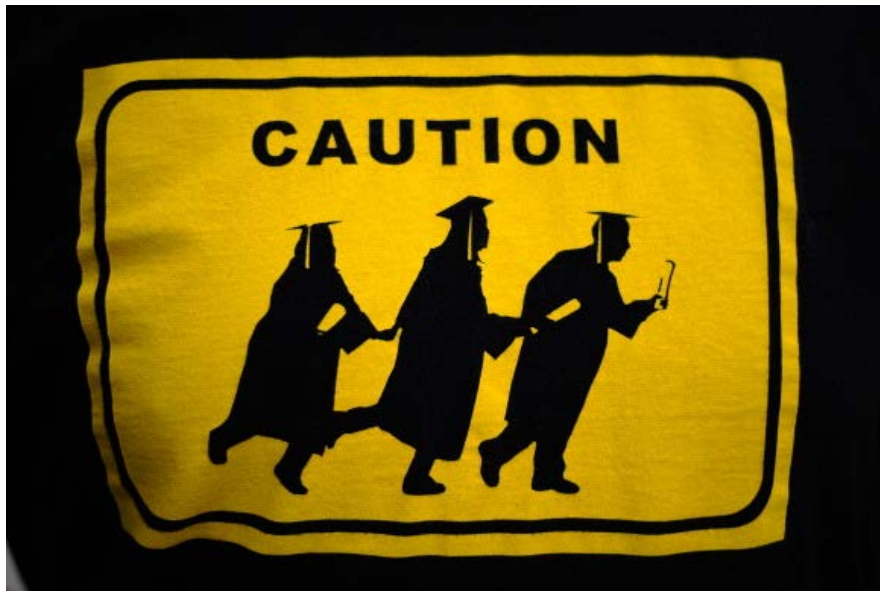
Fig. 7. Immigration Activists Demonstrate in Los Angeles

The third image garbs all three figures in graduation caps and gowns, each holding a diploma. 46 The young child is remade as a slightly smaller peer; all three are no longer desperately fleeing but move at a more upright angle through space. This image recasts the three figures as Dreamers, named after the federal DREAM Act, which would create conditional residency for young immigrants who arrived in the United States as children. The DREAM Act, which has yet to pass, would convert this conditional residency to permanent residence upon two years of college or university, graduation from college or university, or two years of military service without a dishonorable discharge. 47