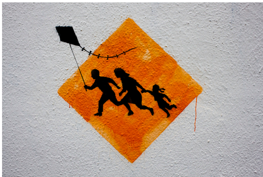
Fig. 14. Brett Landrum, The Kite , by permission.

This is the first iteration of the sign without any text. Removing the words means the viewer is no longer directed to view the image with a particular instruction in mind; the image is deliberately open to interpretation. The kite the man holds flies outside the borders of the sign, suggesting an openness here as well. We could take this as an implicit critique of the policing of closed borders, including nation-state borders, which produce the suffering that led to the Caltrans sign. The yellow diamond could be its own kite, suggesting the family now soars aloft in its own space of dreams and imagination. That the string held up by the man is so straight and short offers the image of a stick supporting a banner or a flag – perhaps, in fact, a sign of protest. 124