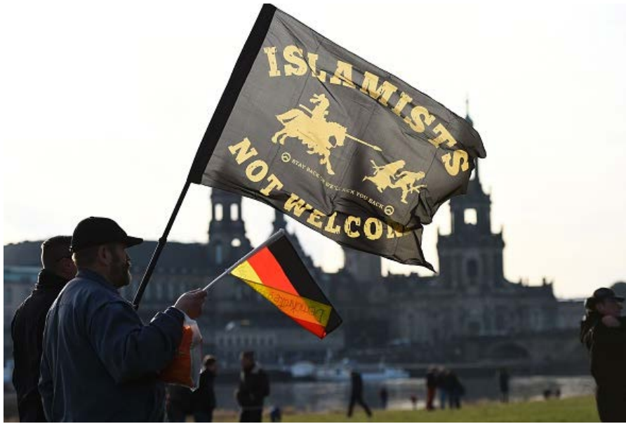
Fig. 13 Tobias Schwarz, Supporters of the PEGIDA Movement Wave a Flag, Dresden, Feb.6 2016 , TOBIAS SCHWARZ/AFP/Getty Image.

Here the burka appears as a symbol not of a submissive woman but as a convenient cover for terrorist weaponry and threat. The refugees no longer welcomed have been subsumed by the identity “Islamist.” The iconography suggests that refugees do not only constitute a threat as male rapists of German women; both female and male refugees also pose a threat to Germany as Islamist terrorists.