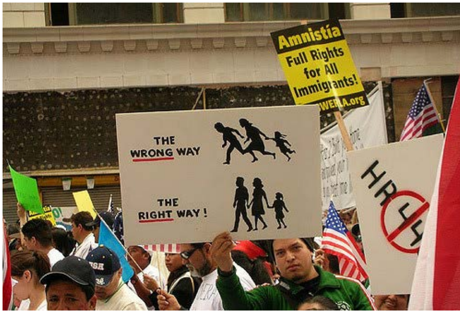
Fig. 8. Bob Morris, The Right Way , licensed under CC BY 2.0.