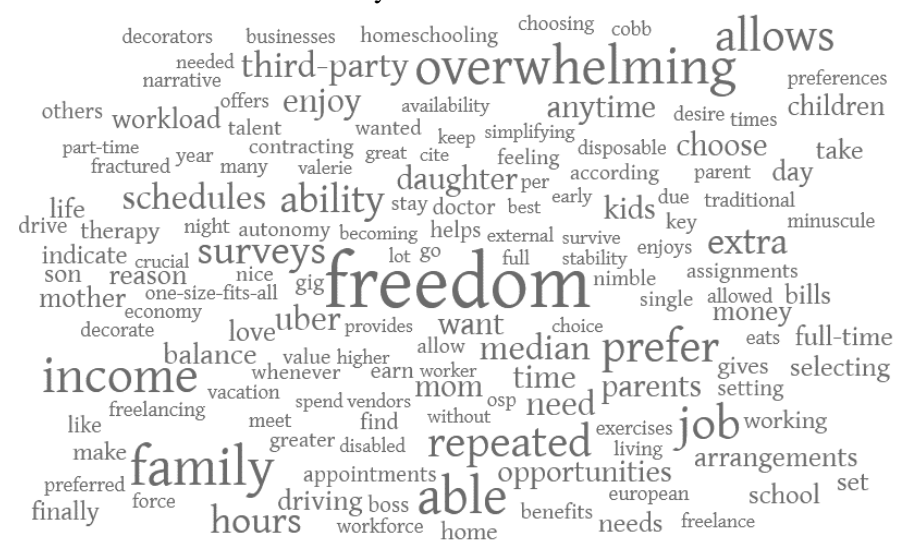
Figure 1: Top 150 Distinguishing Words: Schedule Flexibility Keyword Windows

Table 1, below, lists those nine categories with definitions and example comments for each. Except for "nonspecific flexibility," which captures comments that speak generally to the need for and desirability of flexibility without further detail, the categories are not mutually exclusive, meaning that any comment that contained a specific flexibility topic could also contain more than one. For example, this commenter sounds notes of both family and autonomy: "This ideal combination of stable workflow and flexible schedule has also allowed me to be a work-at-home mom and wife and aunt, and to gain the priceless joy of giving my family my best all the time, not crammed in around some employer's random requirements. To paraphrase Vivian Ward in Pretty Woman , 'I say who, I say when, I say how much." The commenter's implicit equating of gig work and sex work—through the Pretty